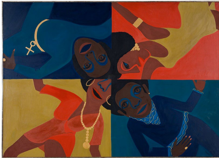
Faith Ringgold, Black Light Series #12: Party Time , 1969. Oil on canvas; 59 3/4 × 85 1/2 in. (152 × 217 cm). Glenstone Museum, Potomac, Maryland. © 2023 Faith Ringgold / Artists Rights Society (ARS), New York.